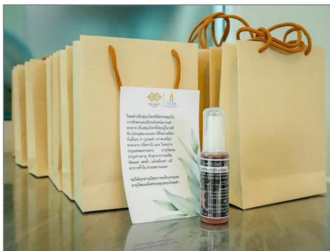
Herbs - Black prick