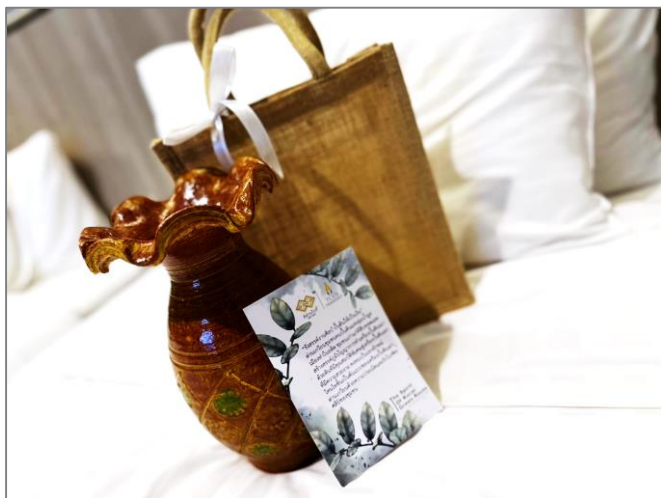
Pottery from Dan Kwian